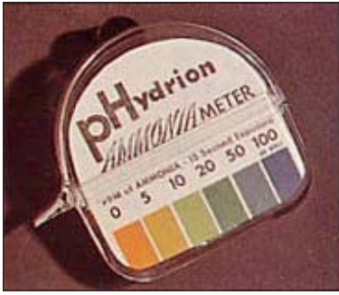
Ammonia strips.