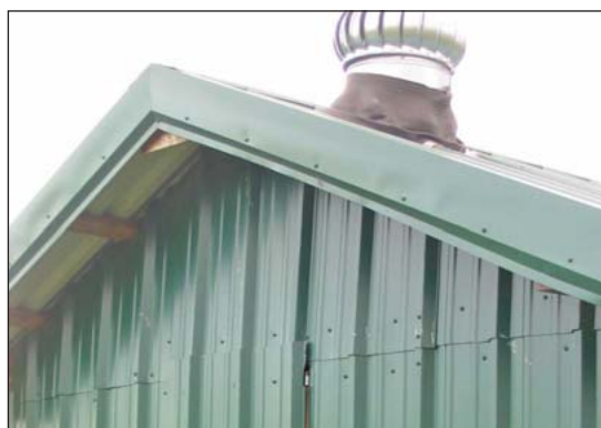
This small mobile house has an air inlet in the end wall and a “whirly-bird” vent on the roof to allow air and moisture to escape.