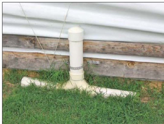
PVC pipes with the bait placed inside can be indoors and outdoors. Stations help prevent nontarget animal from accessing bait.

I n addition to controlling rodents, wild birds should also be controlled because they can introduce disease.