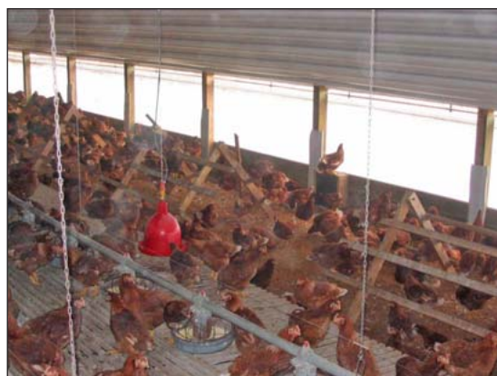
The indoor area is just as important as the outdoor area in free-range poultry production.

While access to the outdoors is an important feature of many alternative or free-range production systems, the indoor environment and management are also crucial. Poultry need access to an appropriate indoor environment for good production and welfare. Ideally, poultry should choose an environment; whether to be indoors or outdoors. Attention to ventilation, temperature, lighting, and litter conditions is needed. Additional good management practices include rodent control with a minimum of toxic materials. Alternative poultry production is often on a small scale, with portable houses. Production may be certified organic. Special practices may be needed compared to conventional poultry production. Alternative poultry production is a way to boost farm income and add fertility or diversity to a farm, while providing specialty poultry products to consumers as a part of sustainable agriculture.