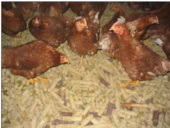
Corn cob litter.

Litter management is very important in most poultry production systems. Floors in poultry houses are usually concrete, wood, or earthen, and litter is used to cover the floor. Litter dilutes manure and absorbs moisture, provides cushioning and insulation for the birds, and captures nutrients for spreading where desired outside. Litter is also a medium for birds to scratch and is important for welfare. Birds are also raised on slat flooring through which the droppings fall into a pit below and are later removed. Keeping droppings dry will reduce odors and flies.