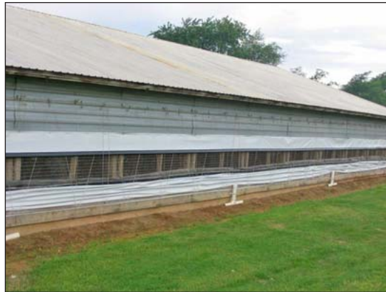
Curtains can be lowered to provide natural ventilation.

In mechanical ventilation, positive and negative pressure systems use fans to direct air into the house (positive) or exhaust air from the house (negative). The negative pressure system is most common and controls the air inlet to help mix the incoming fresh air with the air in the house. (1) Mechanical ventilation is less appropriate for free-range houses because the doorways must be closed to maintain “static pressure.” For more information see Appendix 1: Mechanical Ventilation.