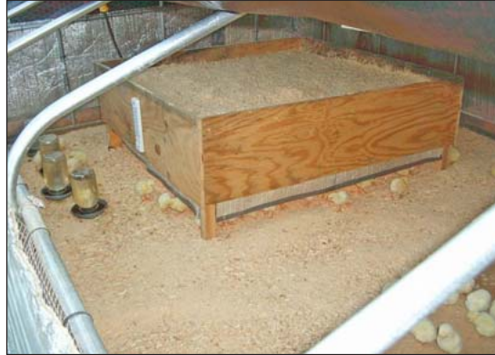
A hover used in a field pen.