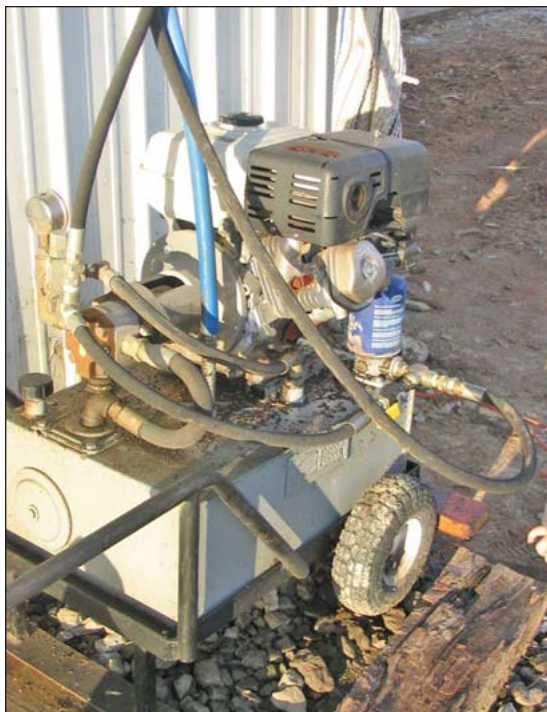
A gas-powered hydraulic motor that augers feed in a house without electricity.