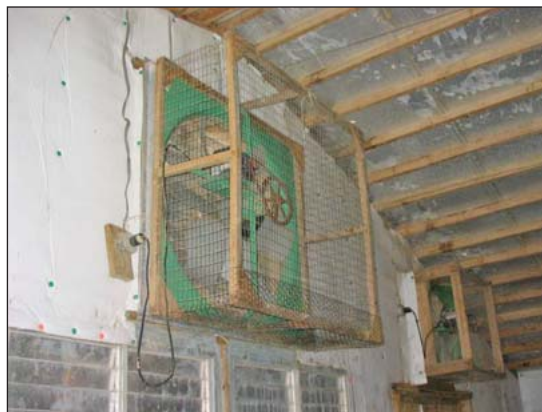
Fans can help exhaust air and moisture out of a house.