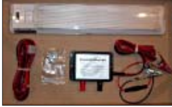
A 12-volt lighting system for small poultry houses.

Amish poultry houses without electricity are sometimes lighted with Coleman lanterns (which burn naphtha gas) and kerosene lamps.