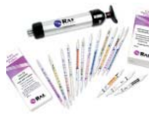
Ammonia levels can be accurately measured with gas detection tubes.

High moisture in litter is very problematic, resulting in cake or a nonabsorbent crust. Caking especially occurs under waterers or other high impact areas. Wet litter causes breast blisters and sores on the birds' foot pads and hocks, and pathogens and parasites such as coccidia proliferate. In wet litter, uric acid is converted by bacteria to ammonia. Ammonia is a toxic gas that can damage the respiratory system of the birds and make them more susceptible to infections. Ammonia levels should not exceed 25 parts per million (ppm) in the house. Levels can be measured with an ammonia meter, but these are expensive. Inexpensive methods are ammonia strips, available from Micro Essential Lab, (6) or dräger tubes, available from Fisher Scientific. (7) Ammonia measurements should be taken at bird level on a regular basis and particularly at finishing. Fly larvae also grow in wet litter and can be a nuisance.