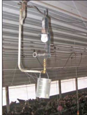
Kerosene lights in a large poultry house without electricity.