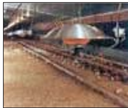
Large propane heaters/brooders.