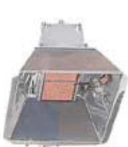
Small infrared heaters/brooders.