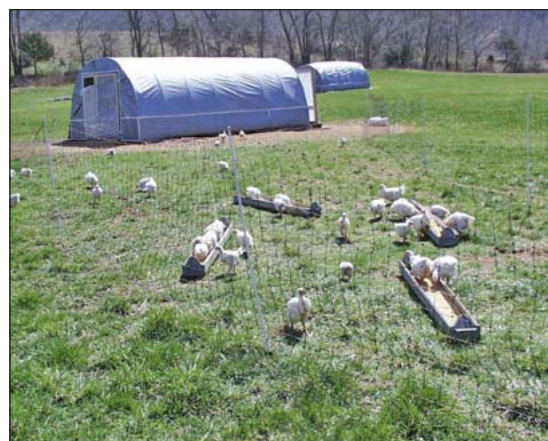
Alternative poultry production usually includes outdoor access.